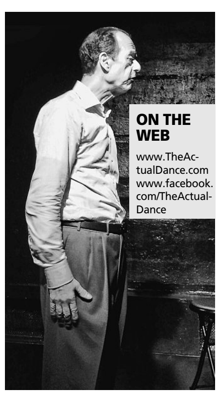
"Actual Dance" has been performed around the country.